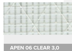
APEN 06 CLEAR 3,0

APEN 06 OD has 3.0 mil film thickness & is designed for demanding One Design applications such as the new Olympic Nacra 17 catamaran. It is available with a range of coloured finishes.