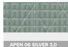
APEN 06 SILVER 3,0